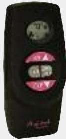
Multi-functional Ambient Technologies® remote controls available for all units