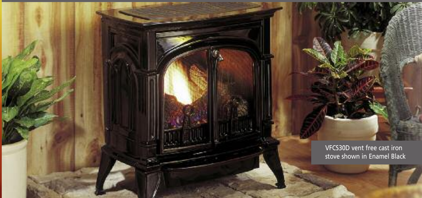
VFCS30D vent free cast iron stove shown in Enamel Black

Give people a place to gather – make fire the focal point of your room again with a Vent Free Stove from Majestic.