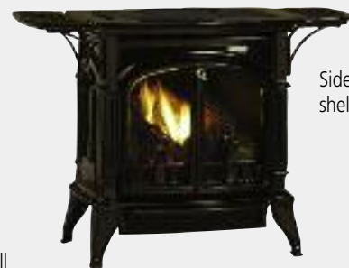
Side warming shelves

Also available: Medium stove screen for operable double doors on CSVF30 and VFCS30 units