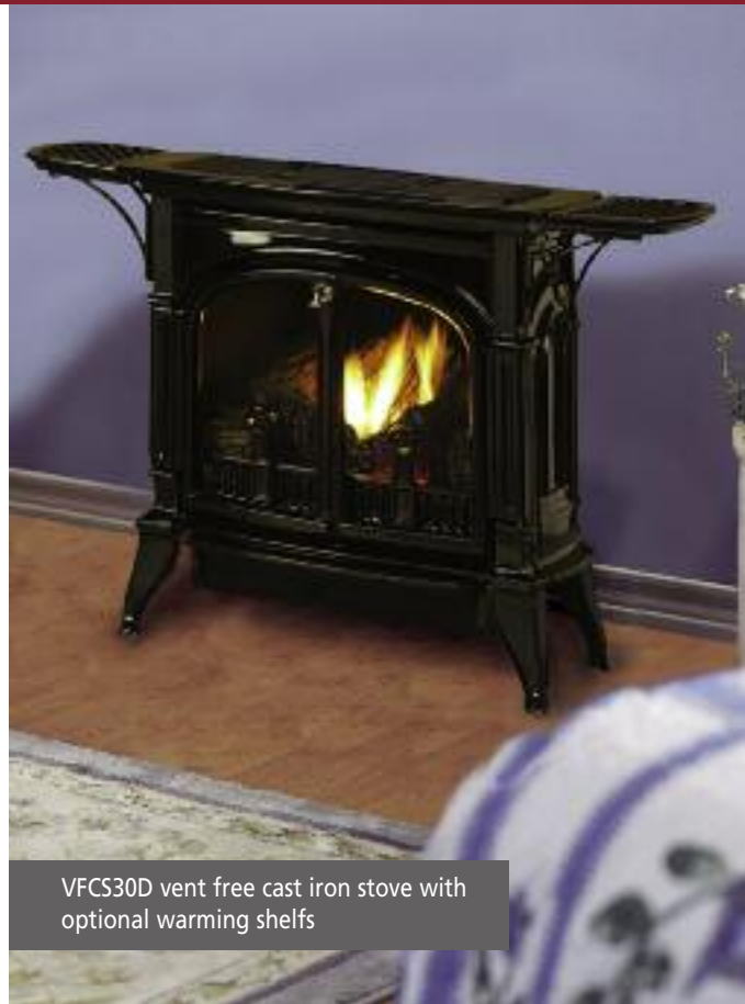
VFCS30D vent free cast iron stove with optional warming shelves

The CSVF30S/VFCS30D features our triple burner, offering yellow flames with glowing logs and embers. With BTU's ranging from 20,000 to 32,000 this stove is perfect for warming up chilly basements, additions and over-the-garage style rooms without having to turn up the furnace.