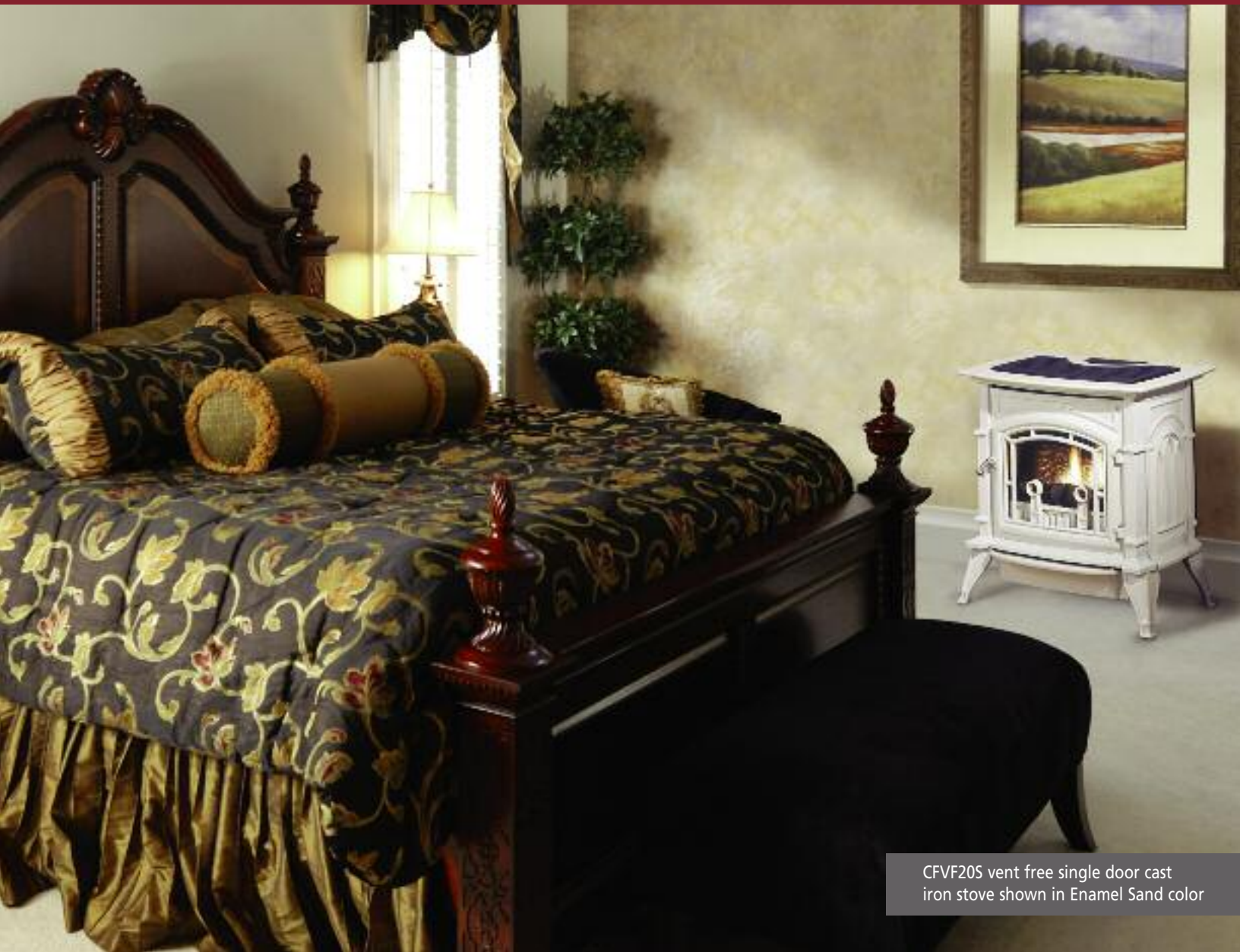
CFVF20S vent free single door cast iron stove shown in Enamel Sand color