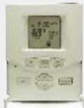
Programmable wireless wall thermostat with receiver