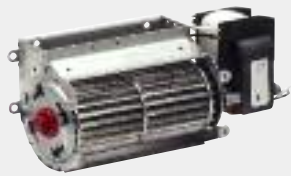
BLOTS variable thermostat blower for CSVF30 and VFCS30 units