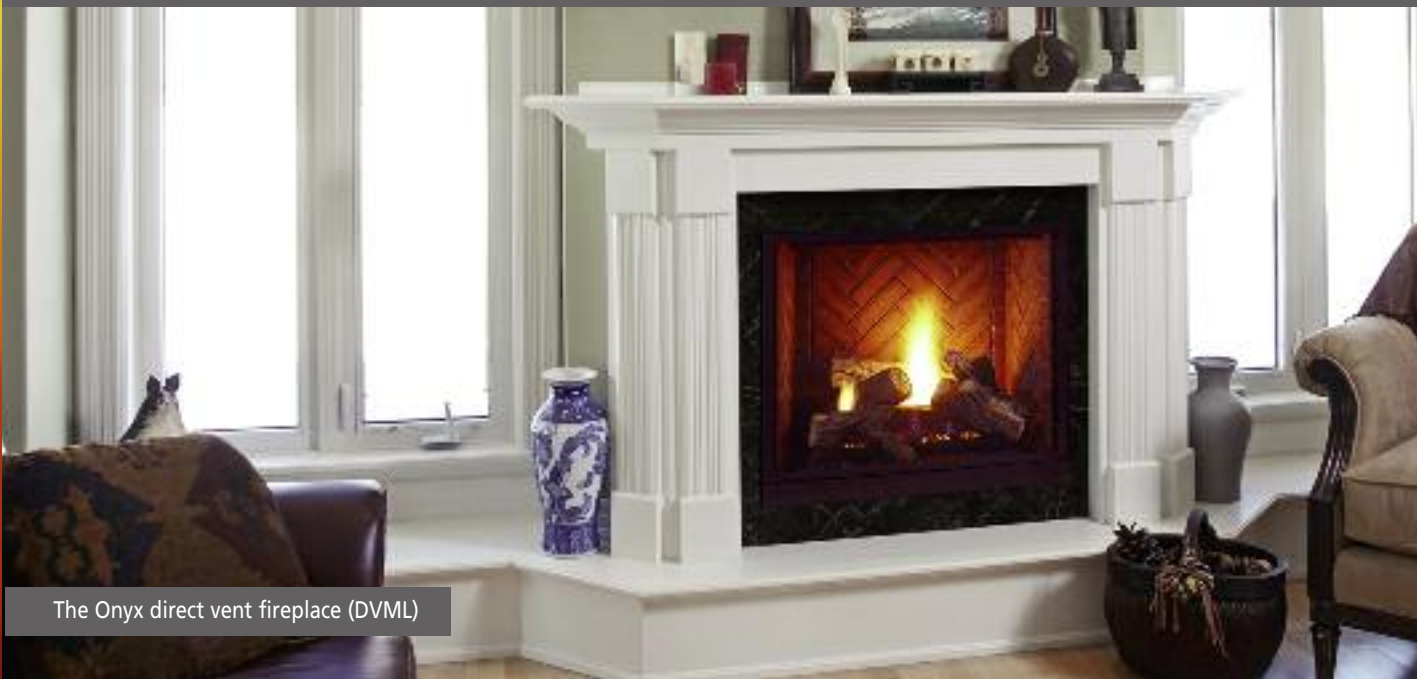
The Onyx direct vent fireplace (DVML)

Give people a place to gather - make fire the focal point of your room again with the Cameo and Onyx series from Majestic.