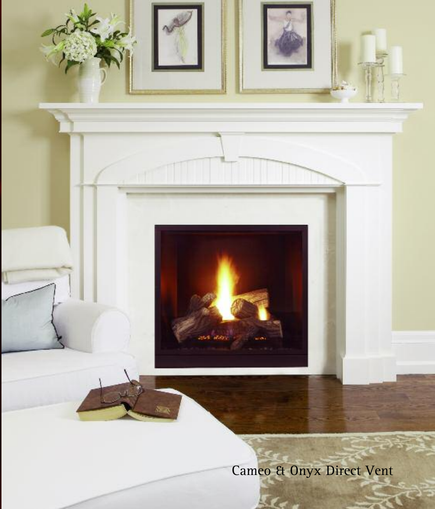
Cameo & Onyx Direct Vent