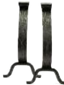
Andirons for DVML

Medium and curved trim kits available for DVM