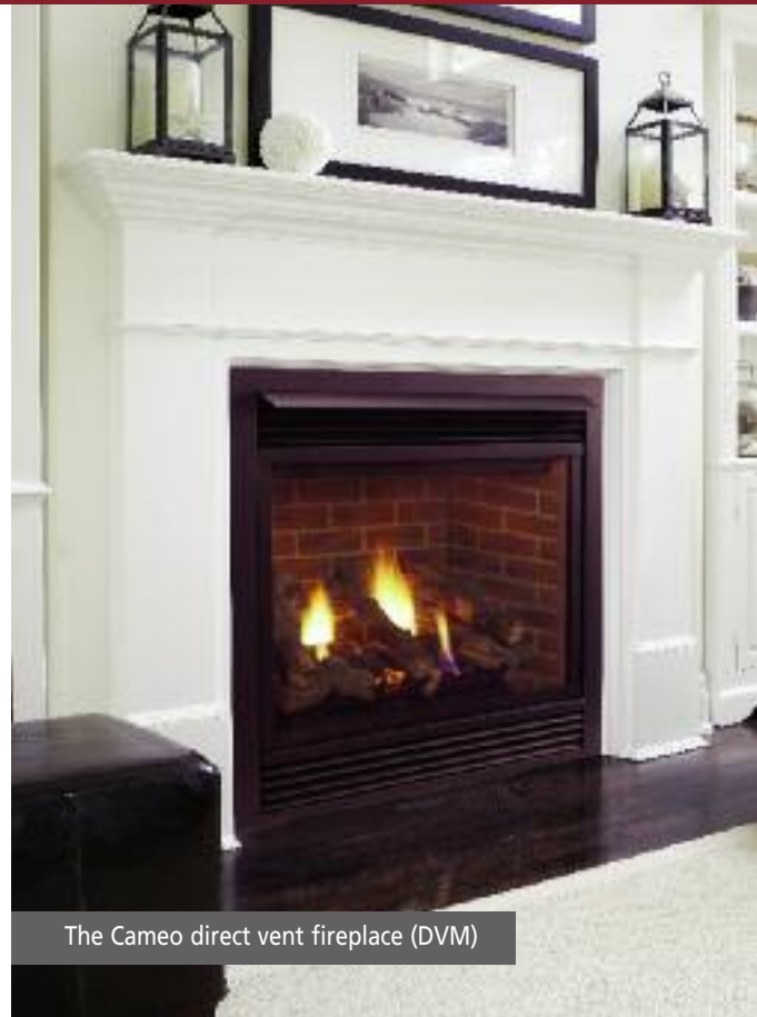
The Cameo direct vent fireplace (DVM)

Choose from multiple trim options, louver finishes, firebrick choices and even multiple decorative front frames or fire screen doors to create your custom look inspired by your home's décor. Bring the ambient warmth of the fire inside: warm up to a Cameo or Onyx direct vent fireplace from Majestic.