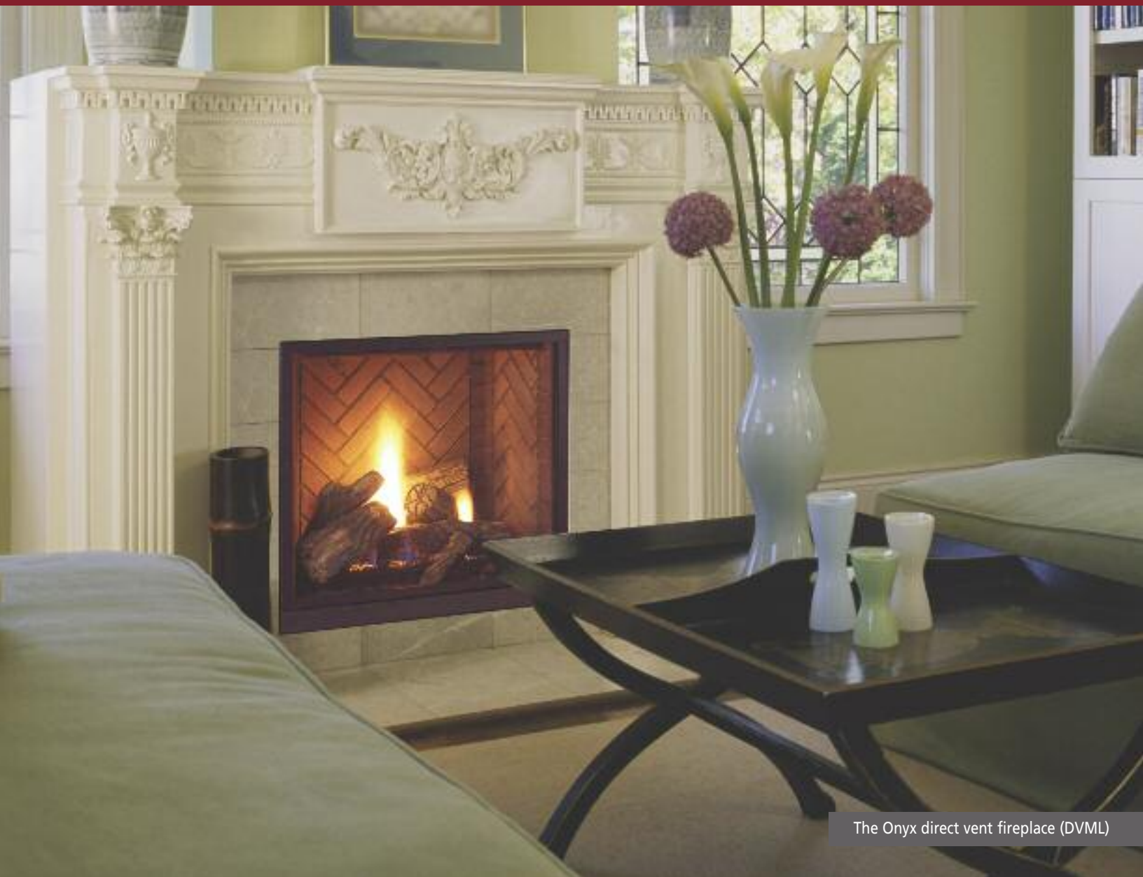
The Onyx direct vent fireplace (DVML)