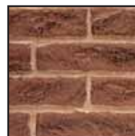
Tavern Brown firebrick

See our Ambient Technologies® catalog for a complete line of remotes and thermostats.