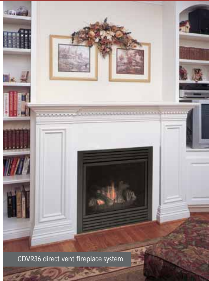
CDV36 direct vent fireplace system

Installing a direct vent fireplace from Majestic is a great way to include elegance and warmth in just about any room in your home. Available in two sizes, the CDV direct vent fireplaces offer either 486 or 591 square inches of viewing area and a range of BTU's from 18,000 to 20,000. With a dedicated top or rear vent design and a number of optional accessories, our CDV fireplaces are the perfect choice for anywhere a warm gathering spot is required.