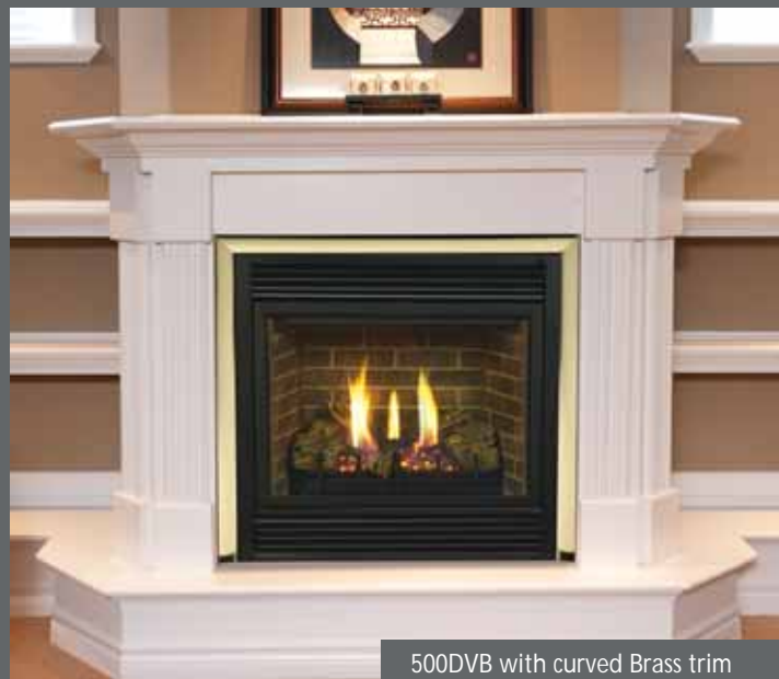
500DVB with curved Brass trim