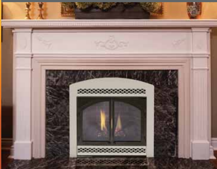
500DVB with Brushed Pewter arched front, black door frame and black fire screen doors

Give people a place to gather – make fire the focal point of your room again with the Direct Vent series of fireplaces from Majestic.