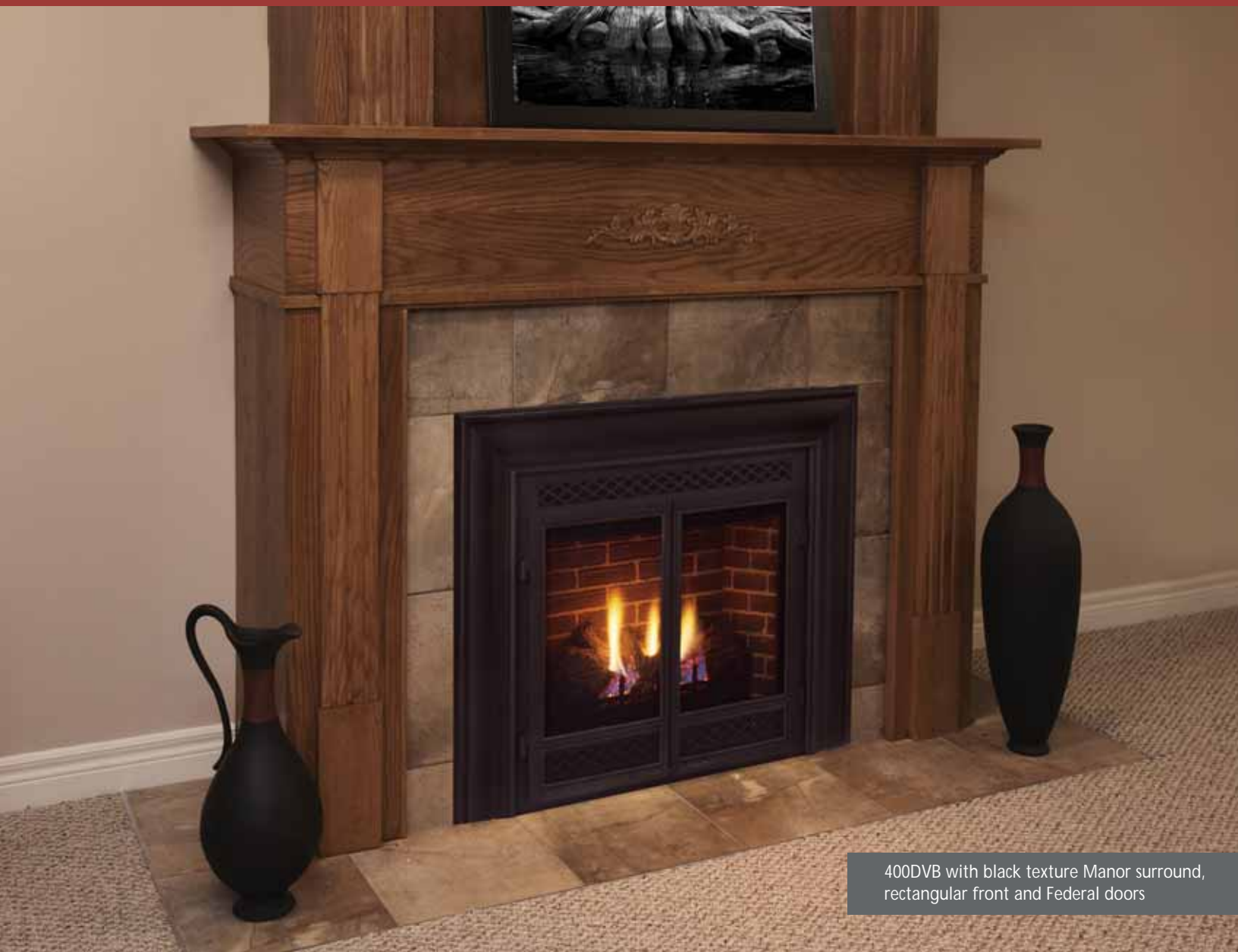
400DVB with black texture Manor surround, rectangular front and Federal doors