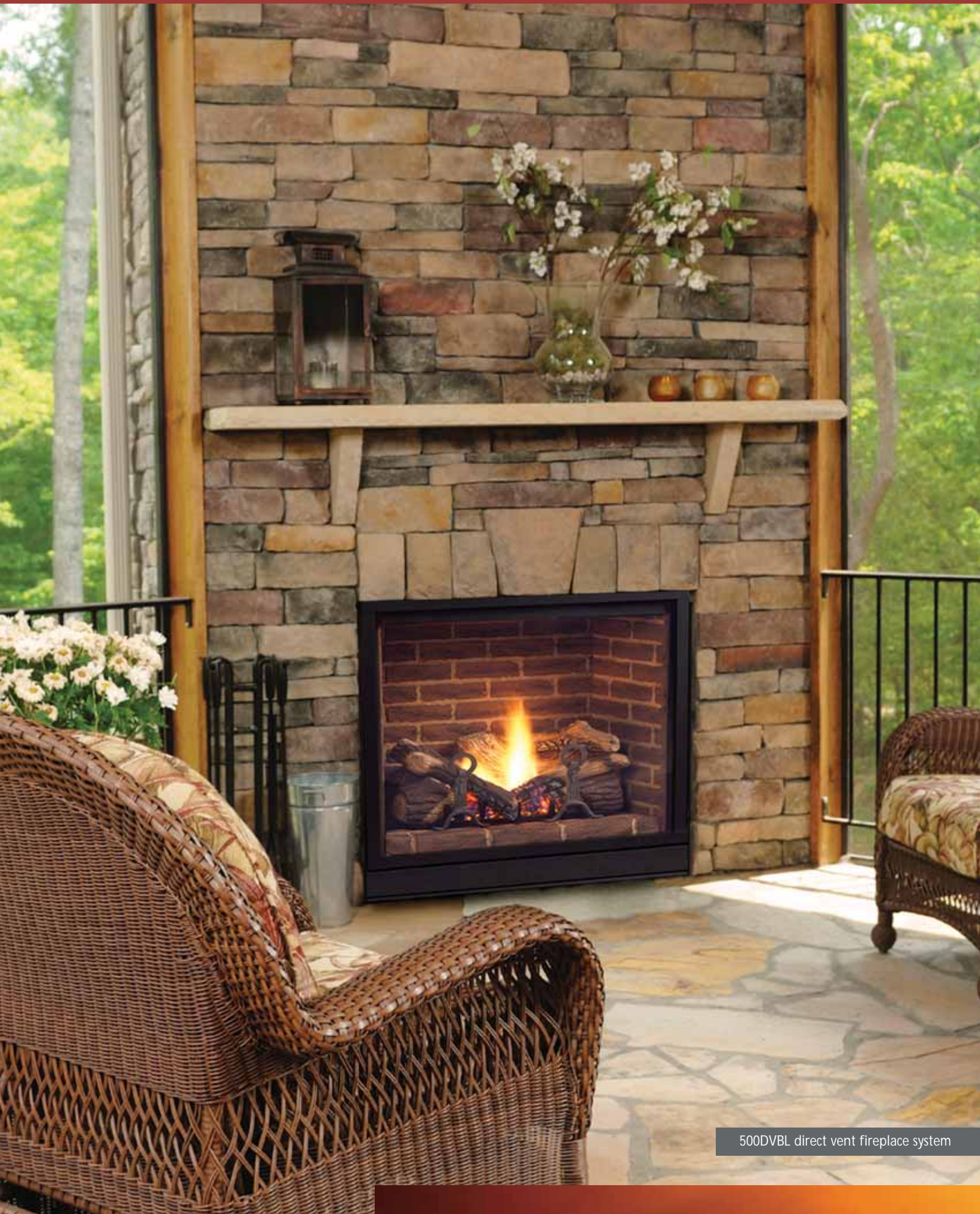
500DVBL direct vent fireplace system