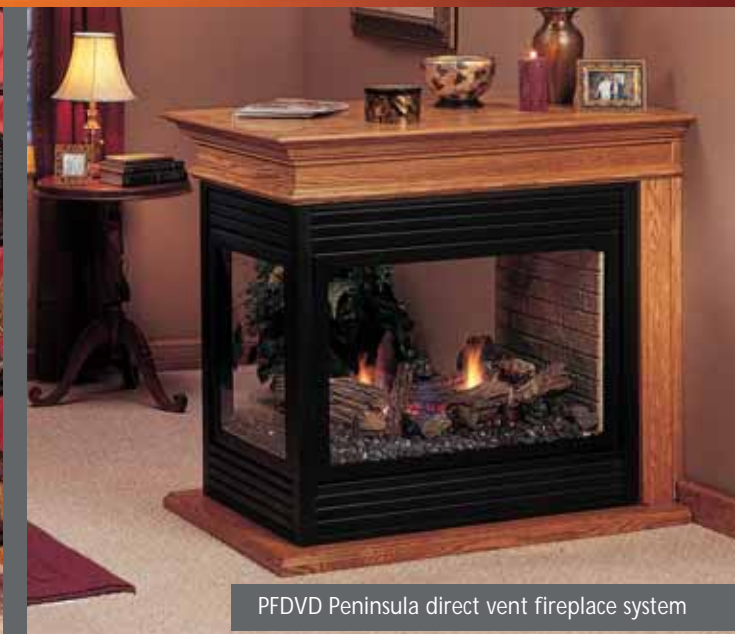
PFDVD Peninsula direct vent fireplace system