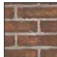
Cottage Red firebrick