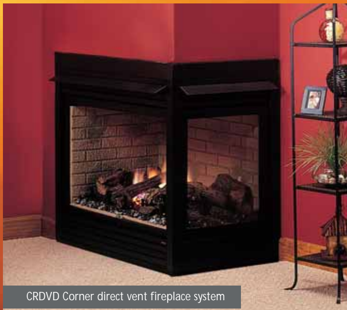
CRDVD Corner direct vent fireplace system

In today's contemporary homes, fireplaces are showing up in all sorts of exciting places such as bathrooms, bedrooms and even as room dividers! Our direct vent Designer Series from Majestic gives you exciting décor options and interesting design applications with Peninsula, See-Thru and Left or Right Corner styles. Plus, with standard Cottage Clay firebrick, louver options and up to 36,000 BTU's, form and function work together to give you an exceptional fireplace performance.