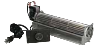
Variable forced air blower (135 cfm)