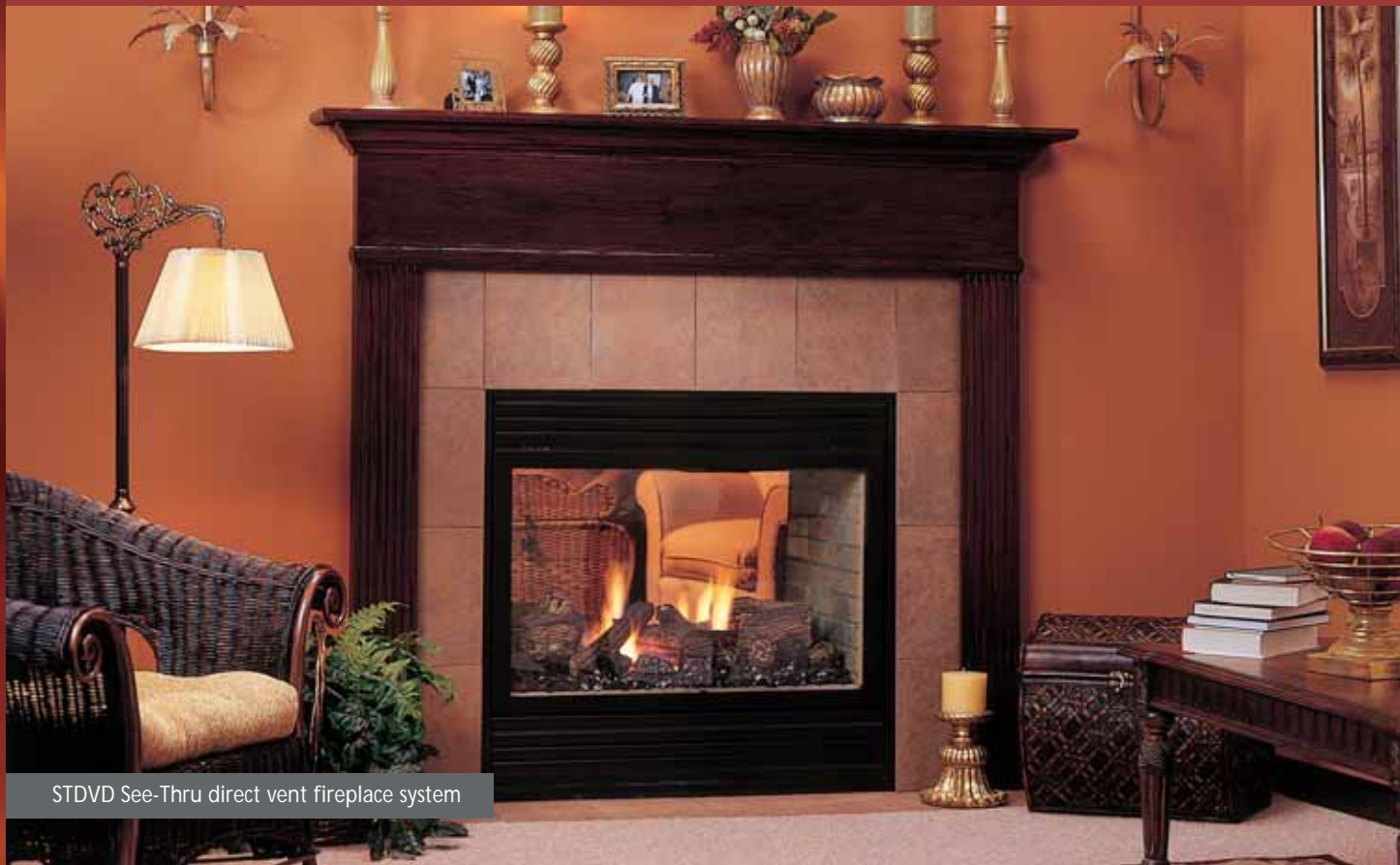
STDVD See-Thru direct vent fireplace system